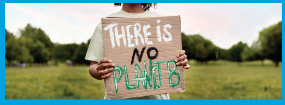
Climate Changemakers: Educating for a Greener World Jul 7 - 17