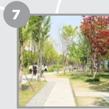
Gyeongui Forest Park