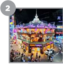
The Royal Palace