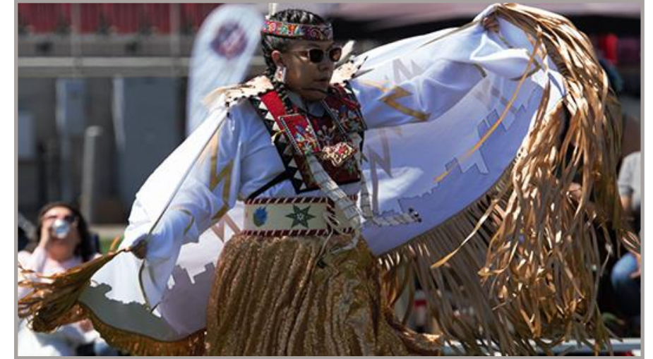
The Indigenous Students' Association at York's (ISAY) 21st All Nations Pow Wow

It is now home to many First Nation, Inuit and Métis communities. We acknowledge the current treaty holders, the Mississaugas of the Credit First Nation. This territory is subject of the Dish with One Spoon Wampum Belt Covenant, an agreement to peaceably share and care for the Great Lakes region.