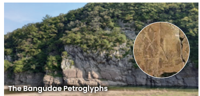
The Bangudae Petroglyphs