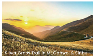
Silver Grass Trail in Mt. Ganwol & Sinbul