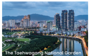
The Taehwagang National Garden