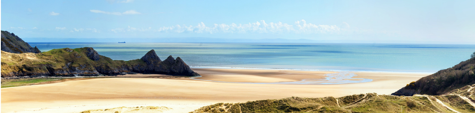
Three Cliffs Bay

And we don’t just mean our wonderful castles! We’ve been welcoming Visiting and Exchange Students to Swansea University for over 30 years.