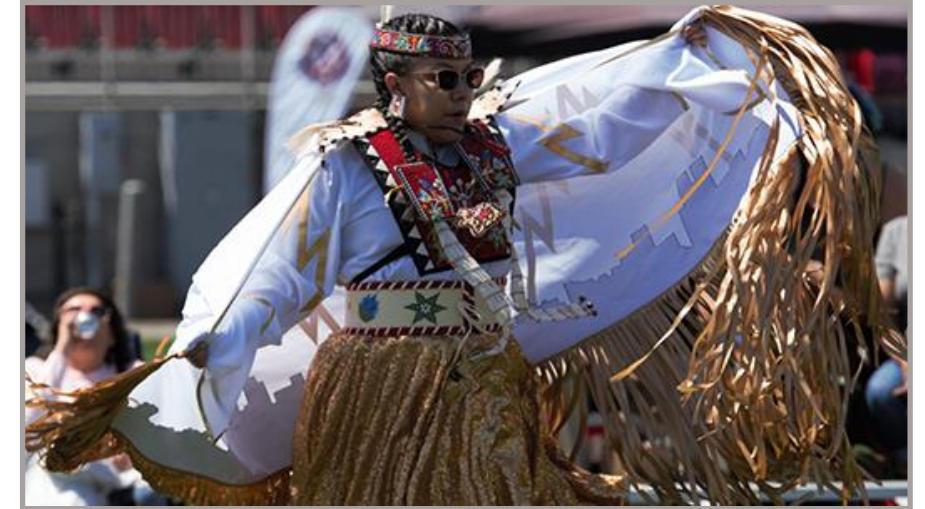
The Indigenous Students' Association at York's (ISAY) 21st All Nations Pow Wow

It is now home to many First Nation, Inuit and Métis communities. We acknowledge the current treaty holders, the Mississaugas of the Credit First Nation. This territory is subject of the Dish with One Spoon Wampum Belt Covenant, an agreement to peaceably share and care for the Great Lakes region.