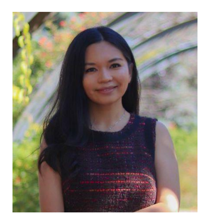
Only a licensed person can give immigration advice.