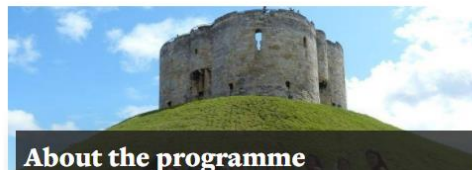
About the programme