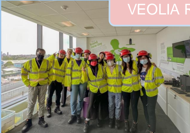
VEOLIA Recycling Plant