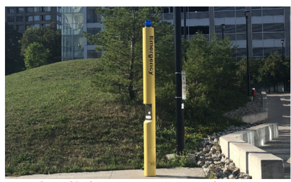
Blue light emergency phone