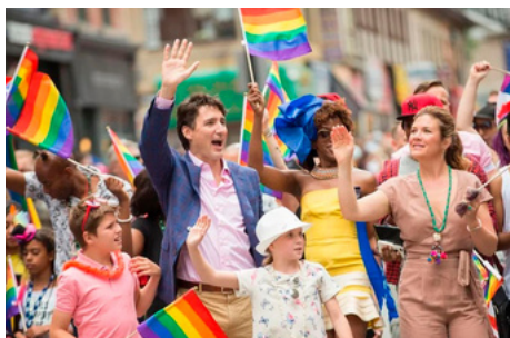
Toronto Pride Month

Here are some notable celebrations in Toronto, if you like to learn more about the history, dates, registration etc. Feel free to look into the link below: