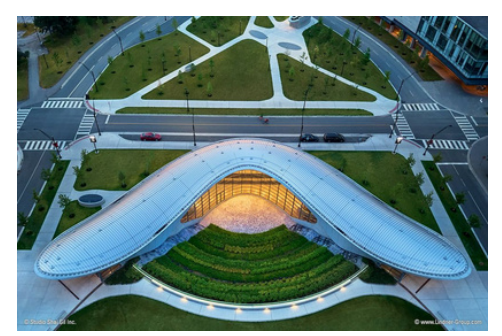
York University Subway Station