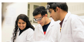
York University advances plans to establish a new School of Medicine