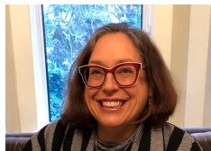
YorkU Professor gives Inaugural Lecture at launch of University of Philippines PhD in Indigenous Studies