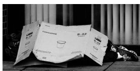
UNECE establishes Toronto Centre of Excellence on Youth Homelessness Prevention at York