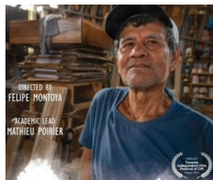
YorkUs 'More than Migrants' Film finalist for the Toronto Independent Film Festival of Cift on August 2021