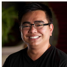
Dance prof's documentary wins at Cannes Indies Cinema Awards