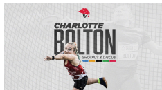
York University student-athlete sets North American record at Tokyo Paralympics